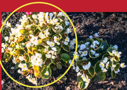
Begonias with & without Nature's Wonder after only 10 days.

The presence of white roots demonstrates continued growth during 3½ week drought.