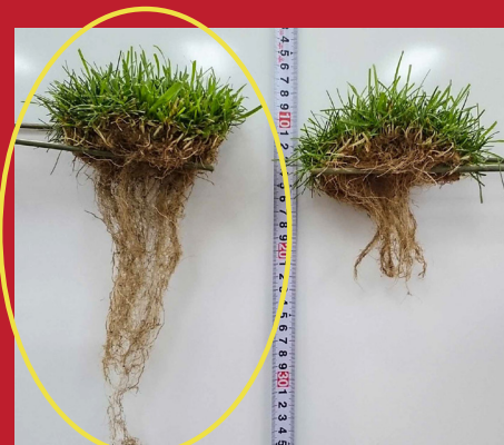
With & without after 3 months. Increased root mass/depth allows drought resistance & nutrient uptake.

Daikon at 17 days with & without APEX-10™.