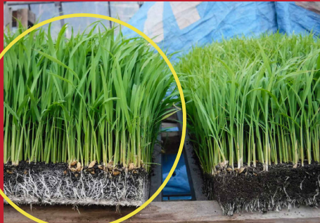
Rice seedlings at 3 weeks, with & without Nature's Wonder®.

Excellent head-start on root development, & will also help with transplant stress & re-establishment.