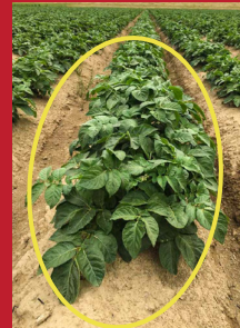
Potato progress this year at the same farm.